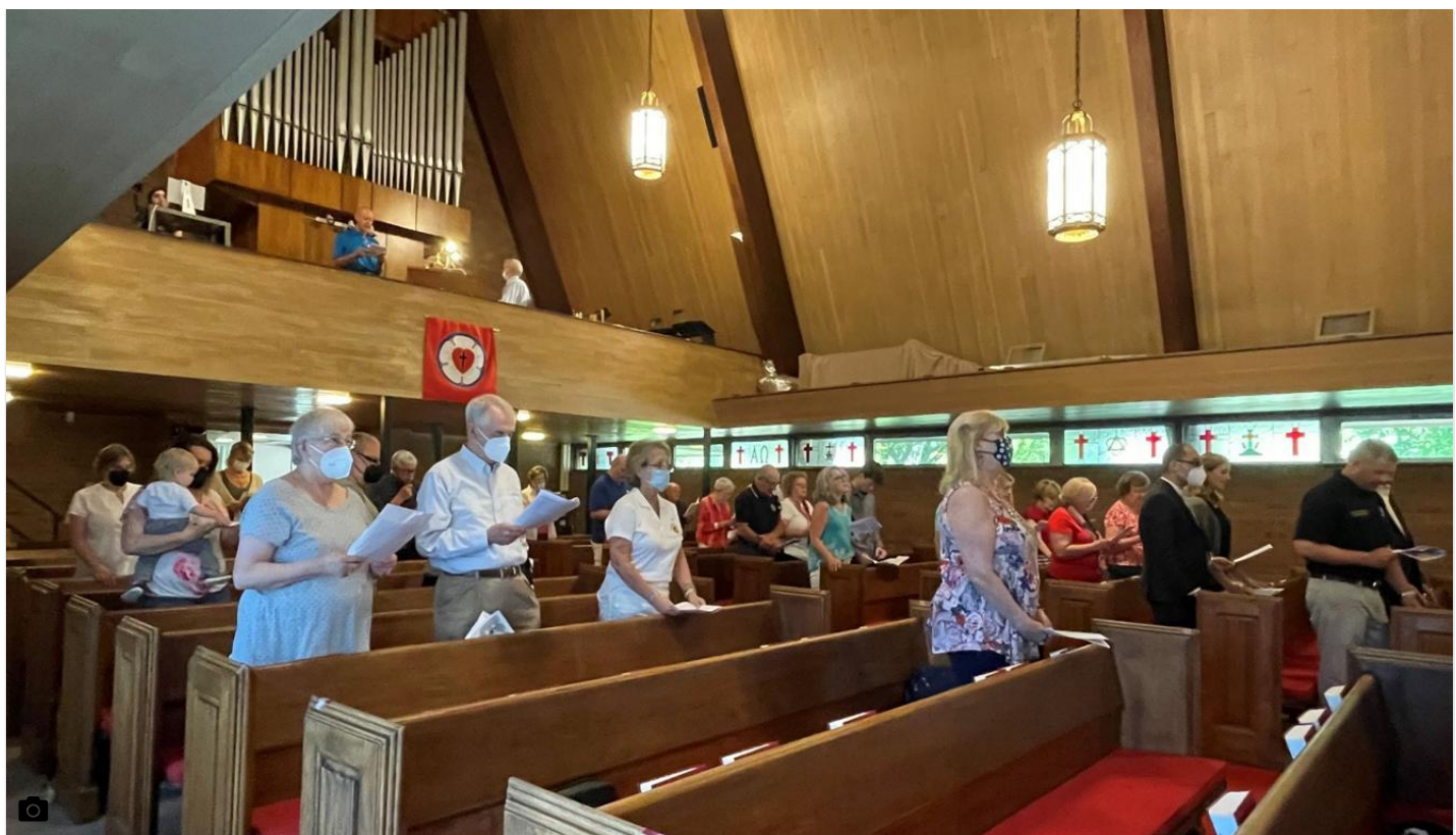
Florham Park, Morris Township churches merging to form 'Amazing Grace Lutheran Church'